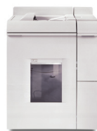
Basic Finisher Module