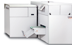
Watkiss PowerSquare 200